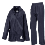
Waterproof jacket and trousers *

All clothes and footwear need to be labelled with your child's name!