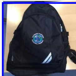
School bag *